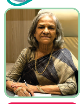
Founder Trustee Ambe Group of Schools