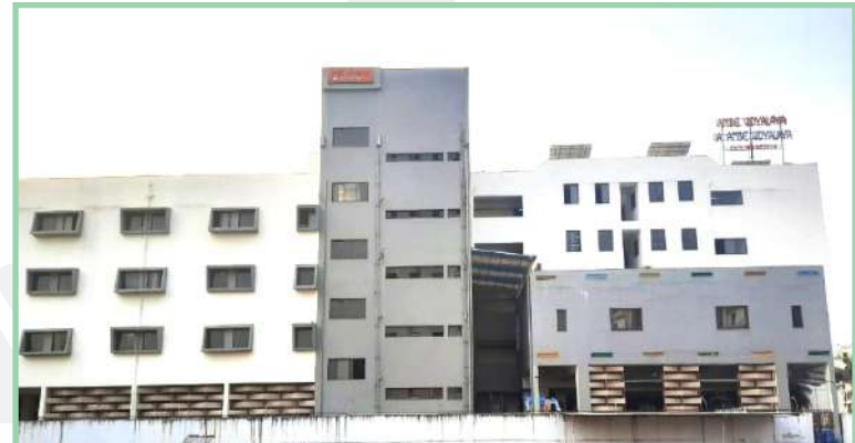
English & Gujarati Medium - KG to Class XII (Science & Commerce Stream)

Bh. Rhythm Hospital, B/s. Panchamrut Flats, Harni,